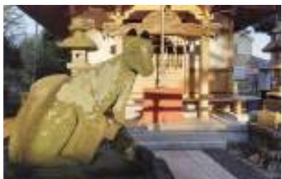
Aoyagi Inari Shrine [A-4] Aoyagi 236, Kunitachi The god of harvest, in the form of a stone fox, provides protection of crops in the Aoyagi area, where citizens enjoy annual events from Dondo Yaki to Bon Dance.