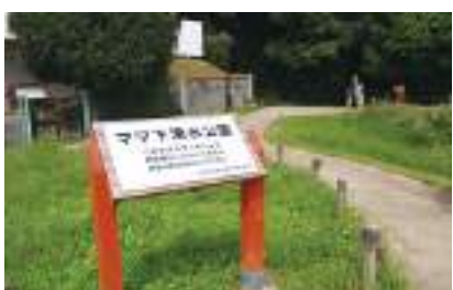
"Mama-shita" Spring Water Park [B-4] Yagawa 3-12, Kunitachi "Mama" is a regional word meaning cliff line. Among the 10 springs located under the cliff line, the highest volume of water flows through "Mama-shita"