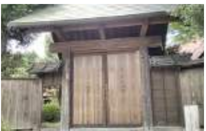
Yakui Gate of the Honda Family [D-4] Yaho 5122, Kunitachi

Visitors can purchase from an assortment of gifts such as hand towels and post cards with pictures or designs depicting the history and nature of Kunitachi.