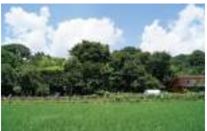
Experience in Rice Cultivation [C-4] Izumi 5-21-20

Information center for agriculture, located in Joyama Park. Here various events such as Harvest Day are planned. The facility is also rented out for private use.