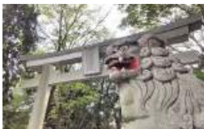
Yabo Tenmangu Shrine [D-4] Yaho 5209, Kunitachi