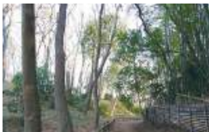
Joyama Park [C-4] Yaho 1700, Kunitachi (Tokyo Historical Natural Environmental Area)