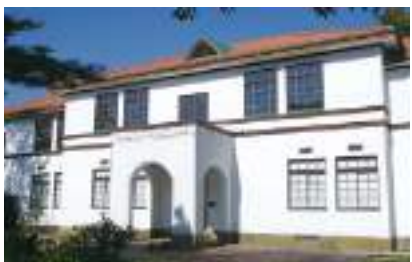
Main Hall of Takingogawa Gakuen [B-4] Yaho 6312, Kunitachi The first Christian welfare facility for the mentally disabled in Japan, Takingogawa Gakuen opens up its main hall to the public in the last week of October.