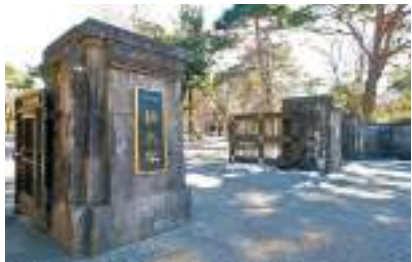
Hitotsubashi University [D-2] *Permission required to enter the premises A national university for social sciences, Hitotsubashi has produced many leaders of industry. After the Great Kanto Earthquake in 1923, it was moved from Kanda.

Enjoy the change of seasons. In Spring, stroll along Daigaku Street under a blanket of cherry blossoms, and in Fall, a blanket of yellow leaves of the ginkgo trees.