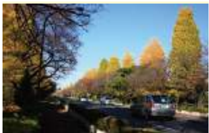
Daigaku Street (Autumn) [D-2/D-3]

Enjoy the change of seasons. In Spring, stroll along Daigaku Street under a blanket of cherry blossoms, and in Fall, a blanket of yellow leaves of the ginkgo trees.