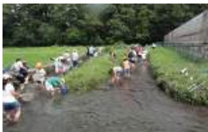
Fuchu Irrigation [B-4/C-4 etc.]

Once the site of a powerful family in the Middle Ages, this land is endowed with a forest that has remained largely untouched by modernization.