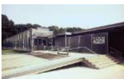
Kunitachi Kyodo Bunka Kan [B-4] Yaho 6231, Kunitachi ☎+81-(0)42-576-0211

During summer, the miniature canals that form the irrigation systems are a precious environmental haven providing sanctuary for insects and small fish.