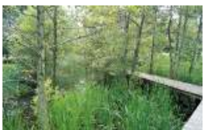
Yagawa Green Zone [A-3/B-3] Hagoromo 3 chome, Tachikawa Situated on the border of Tachikawa, this forested wet land is an oasis for wild birds, and serves as the headwater of Yagawa River.