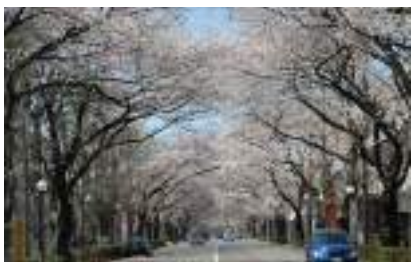
Sakura Street (Spring) [B-3/C-3/D-3]

Every Spring cherry blossoms form a beautiful arch across the street. Naturally, it is a most popular place for taking photographs.