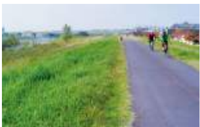
Tamagawa Cycling Course [B-5] Land bordering Tama river bed serves both as a soccer and baseball field. The cycling road running along the bank of the river reaches as far as Tokyo Bay.