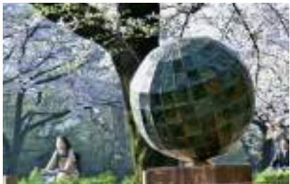
Kunitachi Art Biennale [D-2] The art festival started in 2015 and is held every 2 years. At the end of the festival, the top 6 sculptures are arranged on either side of Daigaku Street.

Every Spring cherry blossoms form a beautiful arch across the street. Naturally, it is a most popular place for taking photographs.